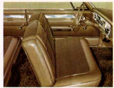
CLOTH AND VINYL UPHOLSTERY—ALL 440 SEDAN AND HARDTOP MODELS

STANDARD ENGINES: 319 cubic-inch V8 (all five models) • 225 cubic-inch Slant-Six (all models, except wagons). STD. TRANSMISSION: 3-speed manual shift. OPTIONAL ENGINES: 383 cubic-inch V8 (2-barrel carburetor) • 383 cubic-inch V8 (4-barrel carburetor) • 425 cubic-inch V8 (4-barrel carburetor) • 425 cubic-inch V8 (two 4-barrel/rm-intake). OPTIONAL TRANSMISSIONS: Torqueflite 3-speed automatic • 4-speed manual, fully synchronized (with 383 or 425 V8 engines only). STANDARD EQUIPMENT: body side, two-tone color insert • full carpeting • vinyl-covered visors • dual horns • foam front seat • dome light • rear pillar lights (hardtop) • oil pressure gauge • glove box lock • cigar lighter • turn signals • armrests, front and rear (all models, including wagons) • individual ash receivers in both rear seat armrests.