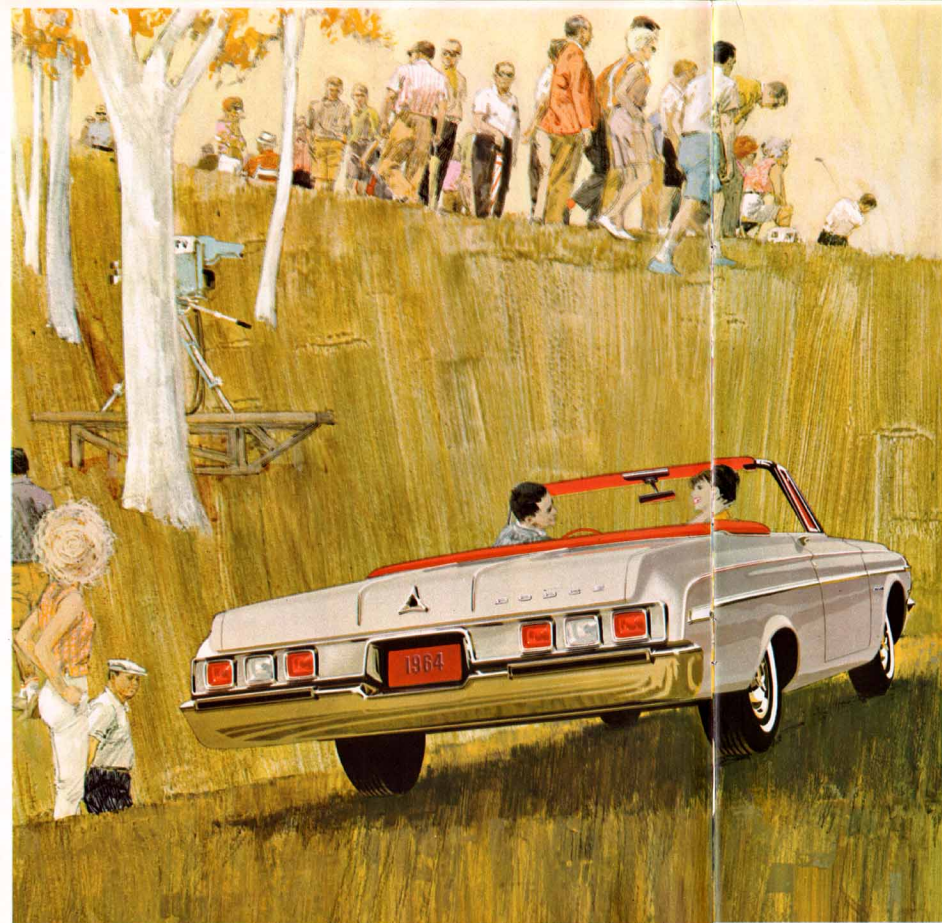
POLARA '64 CONVERTIBLE