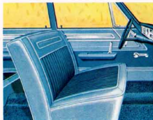
ALL-VINYL UPHOLSTERY DODGE 440 WAGONS