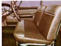
CLOTH AND VINYL UPHOLSTERY, WITH FOLD-DOWN ARMREST (IN UP-POSITION) IN POLARA 4-DOOR SEDAN