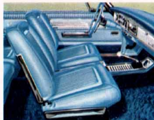
ALL-VINYL UPHOLSTERY; BUCKET SEATS; CENTER CONSOLE— POLARA '64 HARDTOP AND CONVERTIBLE

STANDARD EQUIPMENT: Same as all models in Dodge Polara series (please refer to standard equipment listing for Polara Series.)