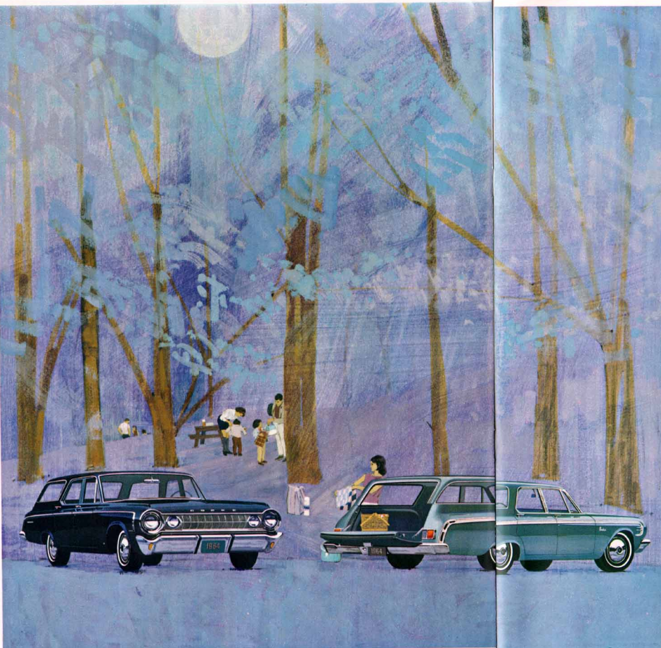
DODGE 330 STATION WAGON (6 AND V8 MODELS)