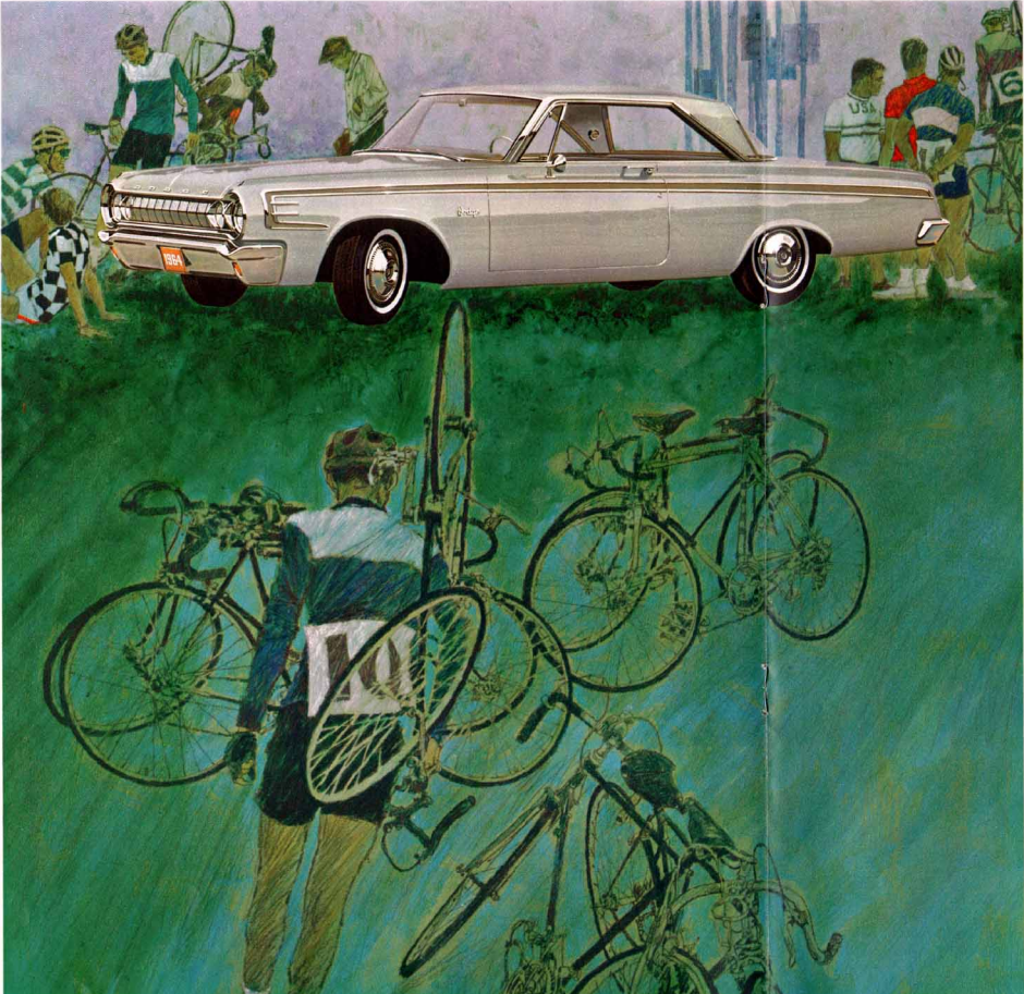
DODGE 440 3-DOOR HARDTOP