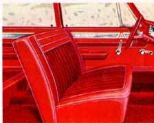
ALL-VINYL UPHOLSTERY DODGE 330 WAGONS

STANDARD ENGINES: 318 cubic-inch V8 (standard on all 6-cylinder station wagons) • 225 cubic-inch Slant Six (offered on 330 wagons only). STANDARD TRANSMISSION: 3-speed manual shift. OPTIONAL ENGINES: 363 cubic-inch V8 (4-barrel carburetor) • 333 cubic-inch V6 (4-barrel carburetor) • 426 cubic-inch V8 (4-barrel carburetor) • 426 cubic-inch Ramcharger V8 (two 4-barrel/ram intake). OPTIONAL TRANSMISSIONS: Pushbutton Torqueflite 3-speed automatic • 4-speed manual, fully-synchronized (with 363 or 426 V8 engines only). STANDARD EQUIPMENT: Floor mats to match interior color (330 models) • full carpeting (440 models) • vinyl-covered sun visors, right and left • dual horns • dome light • oil pressure gauge • glove box lock • cigar lighter • turn signals • armrests, front and rear • individual ash receivers in both rear seat armrests • foam front seat pad and body side two-tone color insert (440 models only).