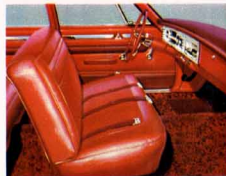
CLOTH AND VINYL UPHOLSTERY—ALL 330 SEDAN MODELS

STANDARD ENGINES: 318 cubic-inch V8 (all models) • 225 cubic-inch Slant-Six (all models). TRANSMISSION: 3-speed manual shift. OPTIONAL ENGINES: 383 cubic-inch V8 (2-barrel carburetor) • 383 cubic-inch V8 (4-barrel carburetor) • 426 cubic-inch V8 (4-barrel carburetor) • 426 cubic-inch V8 (two 4-barrel/ram-intake). OPTIONAL TRANSMISSIONS: Torqueflite 3-speed automatic • 4-speed manual, fully synchronized (with 383 or 426 V8 engines only). STANDARD EQUIPMENT: floor mats in color to match interior • vinyl covered visors • dual horns • dome light • oil pressure gauge • glove box lock • cigar lighter • turn signals • armrests, front and rear • individual ash receivers in both rear seat armrests.