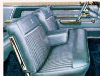
ALL VINYL UPHOLSTERY AND FOLD-DOWN ARMREST—POLARA HARDTOPS AND CONVERTIBLE

STANDARD ENGINES: 318 cubic-inch V8 (all four models) • 225 cubic-inch Slant-Six (2 dr. hardtop, sedan only) STD. TRANSMISSION: 3-speed manual shift. OPTIONAL ENGINES: 383 cubic-inch V8 (2-barrel carburetor) • 383 cubic-inch V8 (4-barrel carburetor) • 426 cubic-inch V8 (4-barrel carburetor) • 426 cubic-inch V8 (two 4-barrel/ram-intake). OPTIONAL TRANSMISSIONS: Torqueflite 3-speed automatic • 4-speed manual, fully synchronized (with 383 or 426 V8 engines only). STANDARD EQUIPMENT: triple taillights • full carpeting • vinyl-covered visors • dual horns • back-up lights • full horn ring • foam pad front seat with fold-down center armrest • dome light • rear pillar lights (2 dr. hardtop) • oil pressure gauge • glove box lock • cigar lighter • turn signals • armrests, front and rear • individual ash receivers in both rear seat armrests.